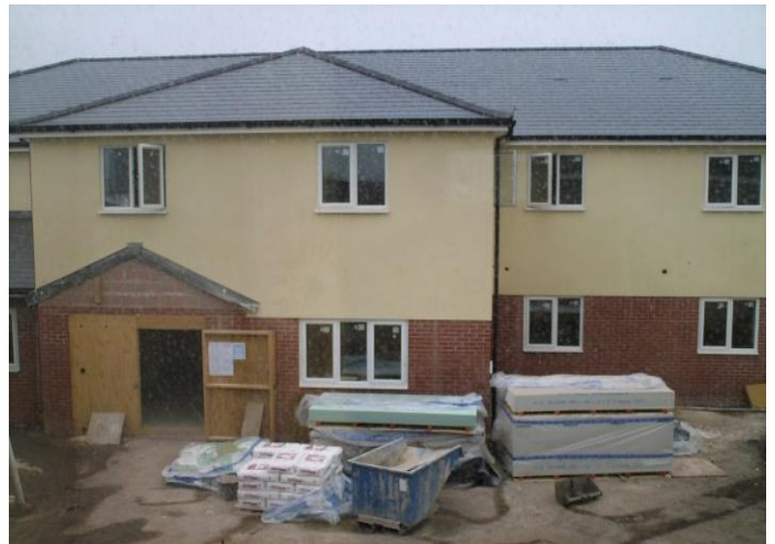
Photographs taken: 13/3/12

If you would like further details, or an information brochure, please contact Gwyneth Virgo (Tel: 866326)